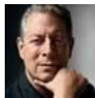
Al Gore Co-Founder & Chairman, Generation Investment Management and former US Vice President (Keynote video address)