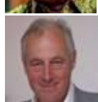
Tim Yeo, MP Chairman, Energy and Climate Change Select Committee, UK