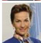
Christiana Figueres Executive Secretary, UNFCCC (by video)