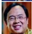
Bambang Brodjonegoro Head of Fiscal Policy Office, Ministry of Finance & Board member of Green Climate Fund, Indonesia