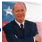
Richard Lagos Former President of Chile, Club de Madrid Task Force on Climate Change