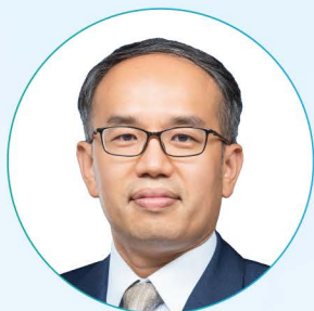
Mr. Christopher Hui, GBS, JP Secretary for Financial Services and the Treasury

Mr Hui has been Secretary for Financial Services and the Treasury since 2020. He serves on the boards of Mass Transit Railway Corporation Limited, Hong Kong Airport Authority and also as the Chairman of the Kowloon-Canton Railway Corporation.