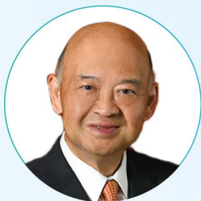
The Honourable Geoffrey Ma, GBM The former Chief Justice of Hong Kong

The Hon Geoffrey Ma GBM is the former Chief Justice of Hong Kong, having retired from that position in January 2021. He is now a professional arbitrator and mediator.