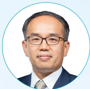
Mr. Christopher Hui, GBS, JP Secretary for Financial Services and the Treasury

Mr Hui has been Secretary for Financial Services and the Treasury since 2020. He serves on the boards of Mass Transit Railway Corporation Limited, Hong Kong Airport Authority and also as the Chairman of the Kowloon-Canton Railway Corporation.