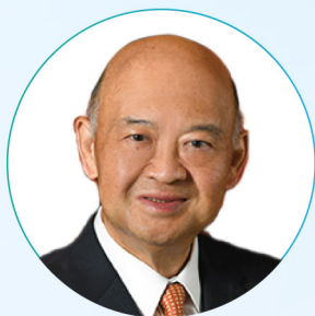
The Honourable Geoffrey Ma, GBM The former Chief Justice of Hong Kong

The Hon Geoffrey Ma GBM is the former Chief Justice of Hong Kong, having retired from that position in January 2021. He is now a professional arbitrator and mediator.