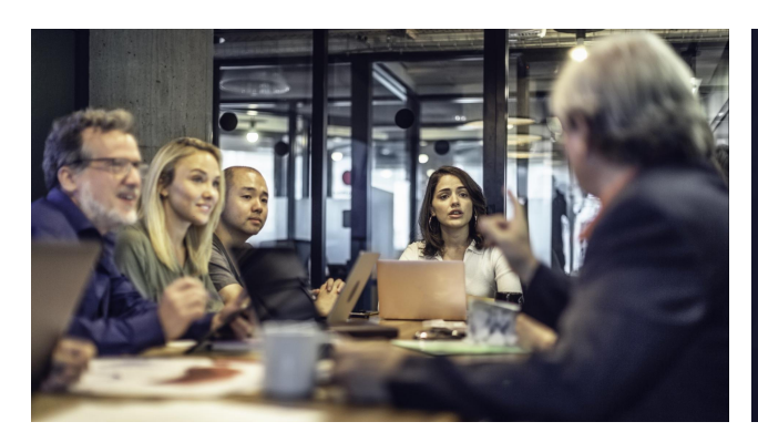
The Intricacies of Serving Family Offices

These courses complement the webinar above and provide a comprehensive understanding of family office operations.