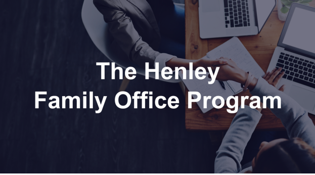
The Henley Family Office Program

All with SFC CPT and PWMA OPT Hours <u>ENROL</u>